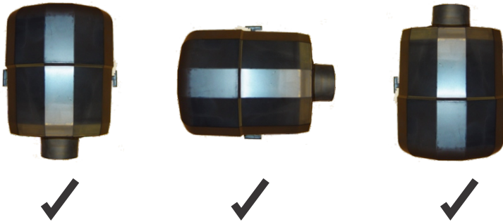
Installation Orientation Options

Failure to follow these instructions will cause premature motor failure.