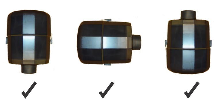
Installation Orientation Options

Installation Environment: Indoor Use Only